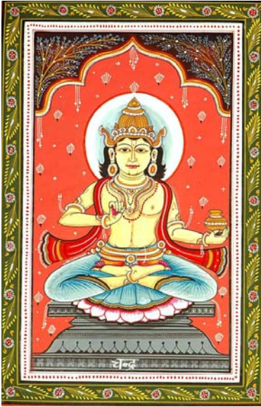
Chandra Moon Goddess