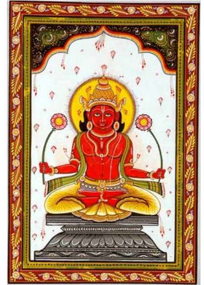
Surya Sun God

Many of you are aware that there are three eclipses within a month and a half's time and have inquired as to the significance. The following is a short explanation.